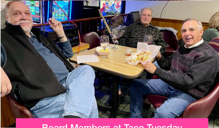
Board Members at Taco Tuesday