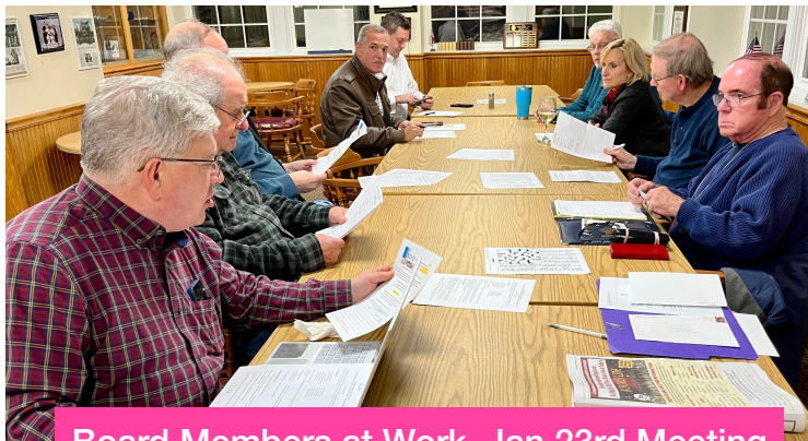
Board Members at Work, Jan 23rd Meeting